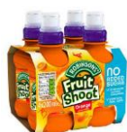
Almost 5 teaspoons sugar